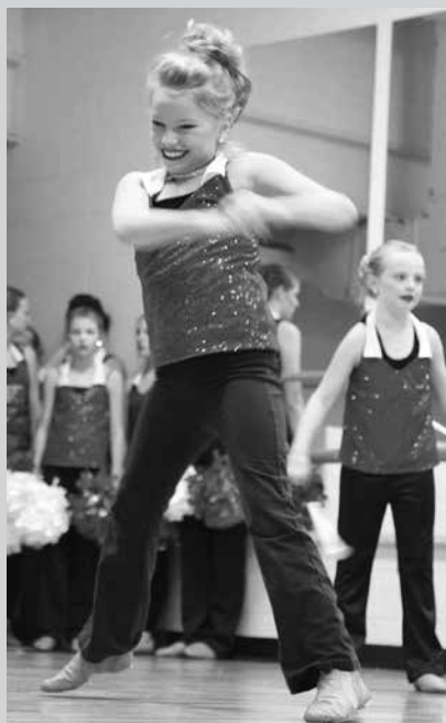
The world-renowned Sue's Stepper-ettes performed at the La Vista Community Center during the annual Tree Lighting Celebration.