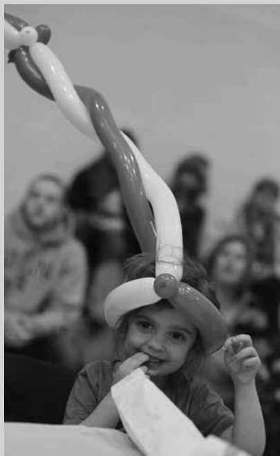
Young and old alike enjoyed many aspects of the annual Tree Lighting Celebration held at the end of November. This little girl sports a balloon hat while enjoying some popcorn.