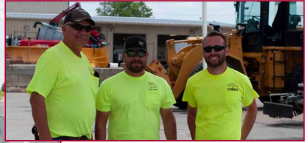
Public Works staff enjoyed interacting with residents and answering questions about their day-to-day duties.