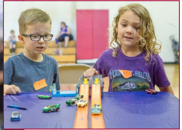
The Hot Wheels Races on Thursday evening were enjoyed by many children.