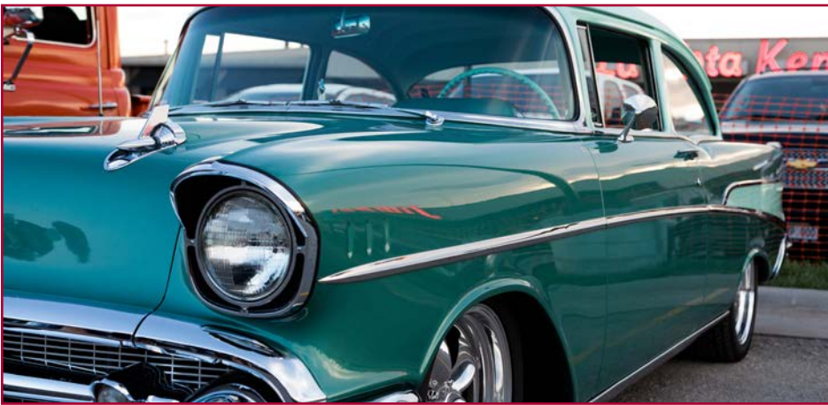
The Sixth Annual Show & Shine, hosted and sponsored by La Vista Keno, attracted a record number of entries this year.

The Salute to Summer Festival would not be possible without the generous contributions of the La Vista Community Foundation, Bellino Fireworks, Wal-Mart Neighborhood Market and La Vista Keno.