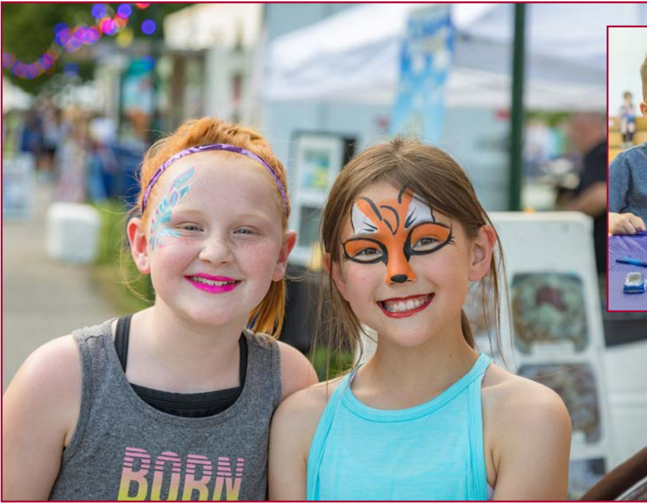
Young and old alike enjoyed the festivities during the Salute to Summer Festival.