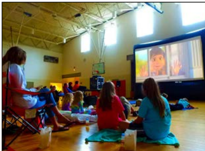
The July concert/movie event was altered due to weather concerns.

For more information, visit our website, CityofLaVista.org/2018events .