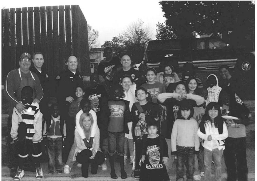
Community Policing in Action — La Vista Police Officers and Mayor Kindig met with residents of Crestview Village and then spent some time getting to know the youth from this area.