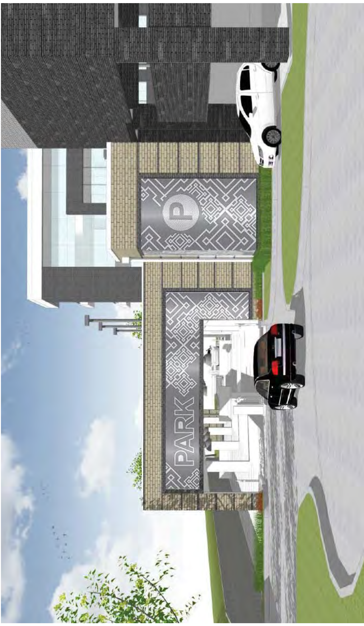
Parking Garage Graphics | Logo Reposition