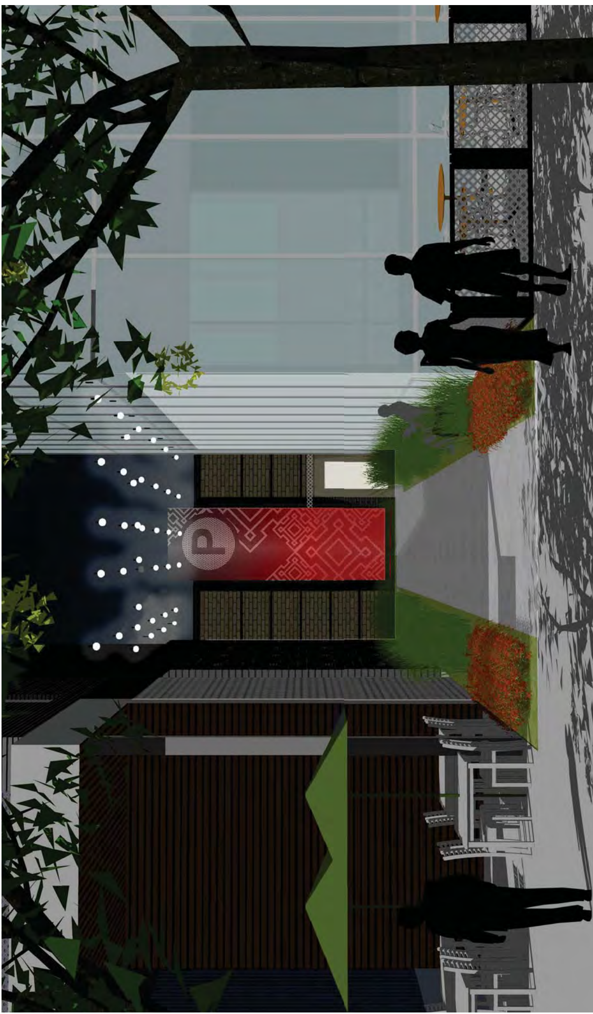
Parking Garage Graphics | Logo Reposition