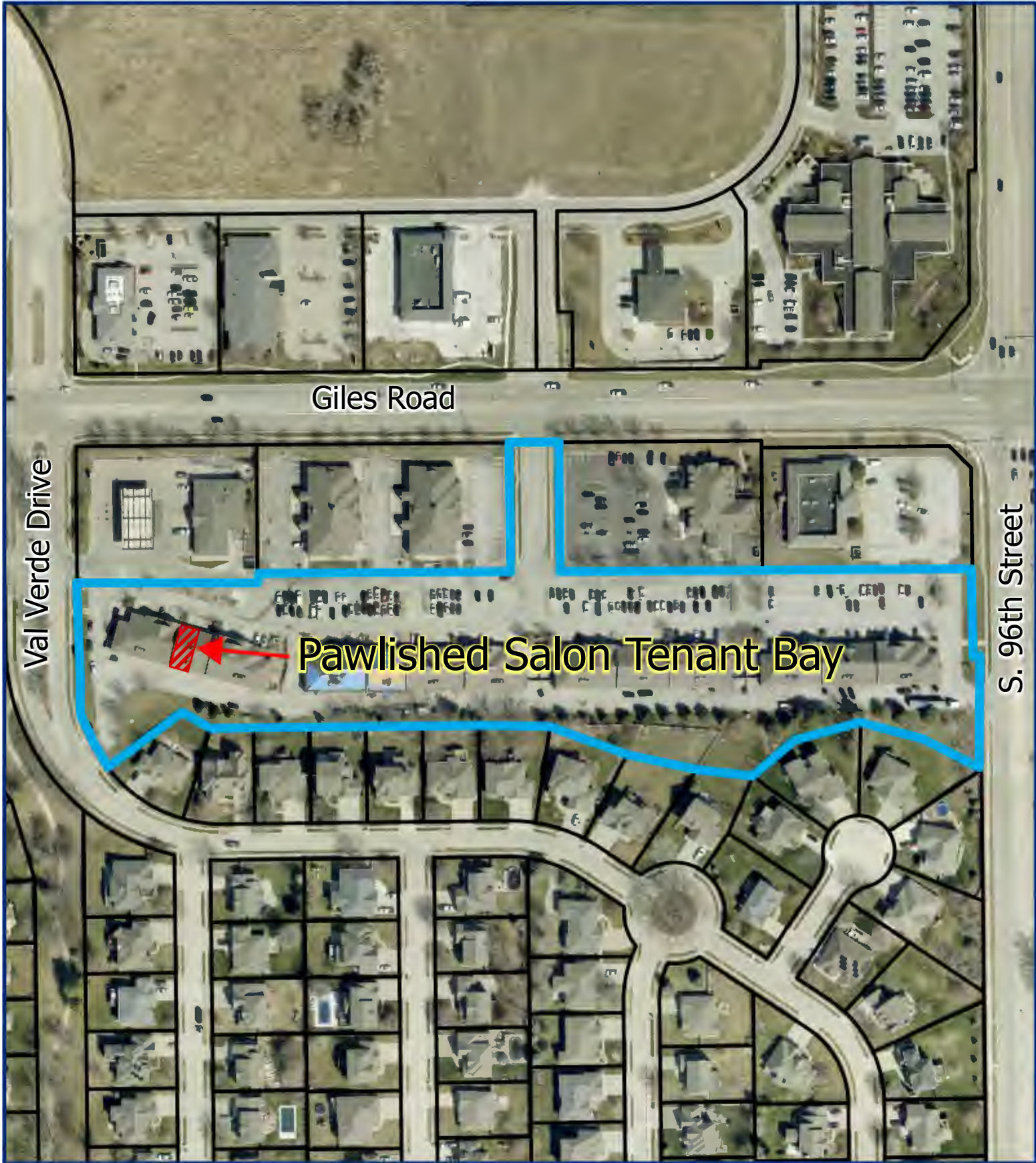
Conditional Use Permit Vicinity Map - Pawlished Salon