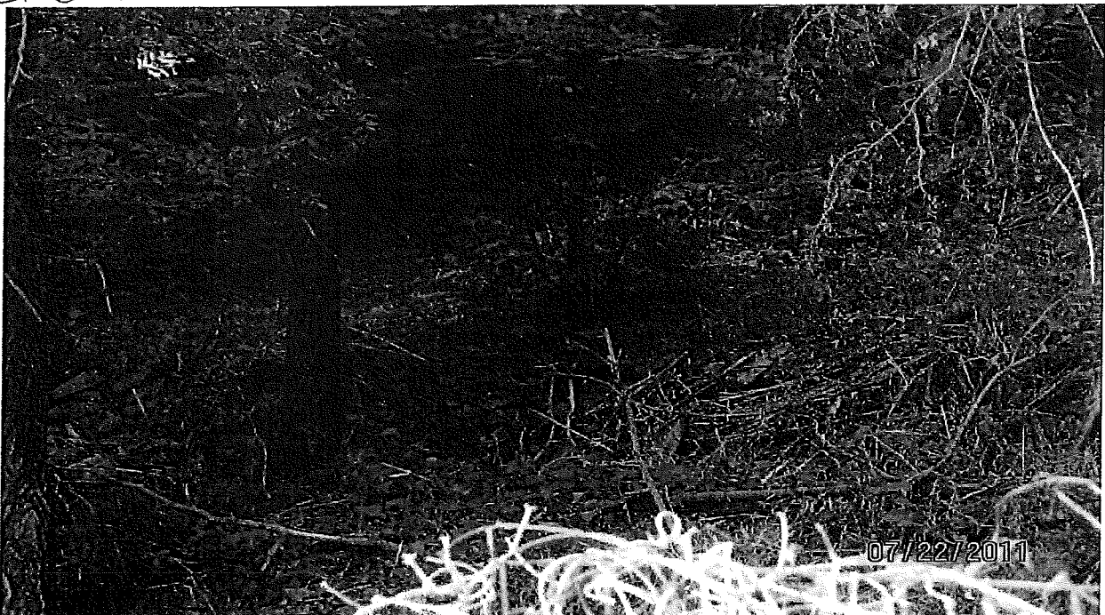
After Pictures Taken By: S. Corbit S. Corbit