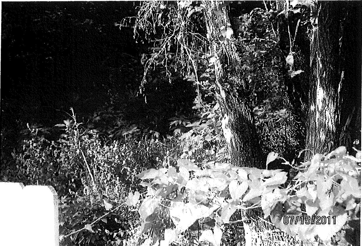
Before Pictures