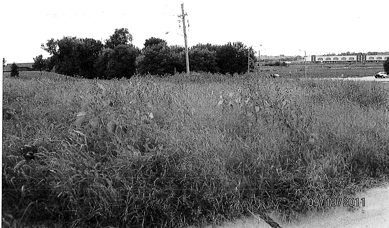
Before Pictures