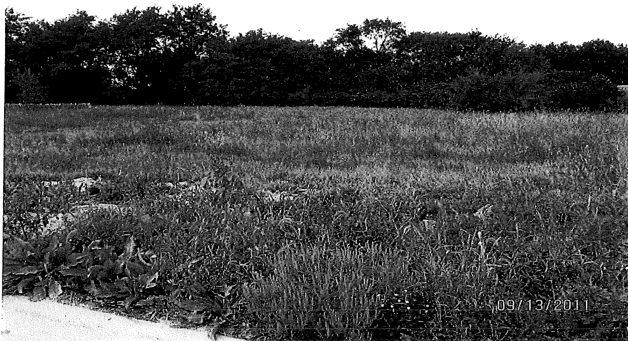
Before Pictures Taken By: S. Corbit S. Corbit