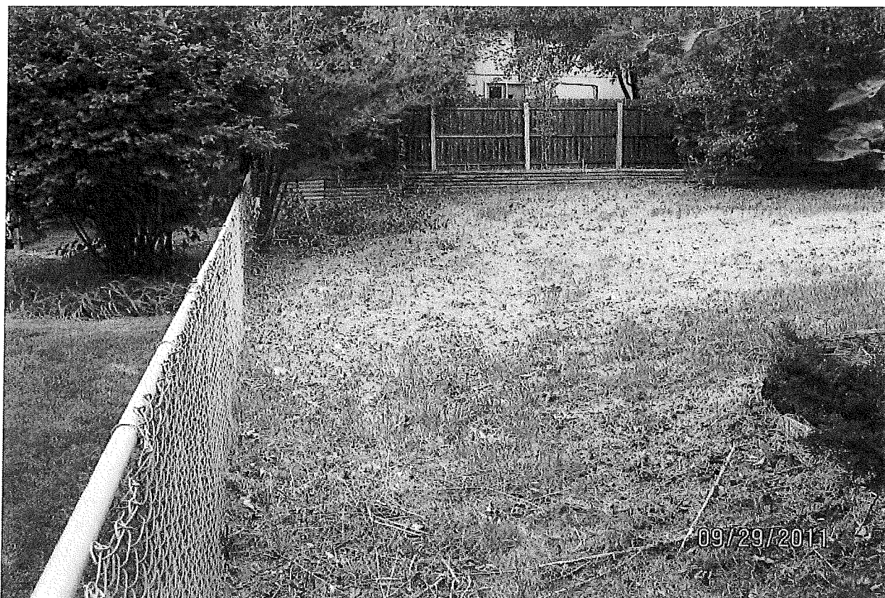
After Pictures Taken By: S. Corbit S. Corbit