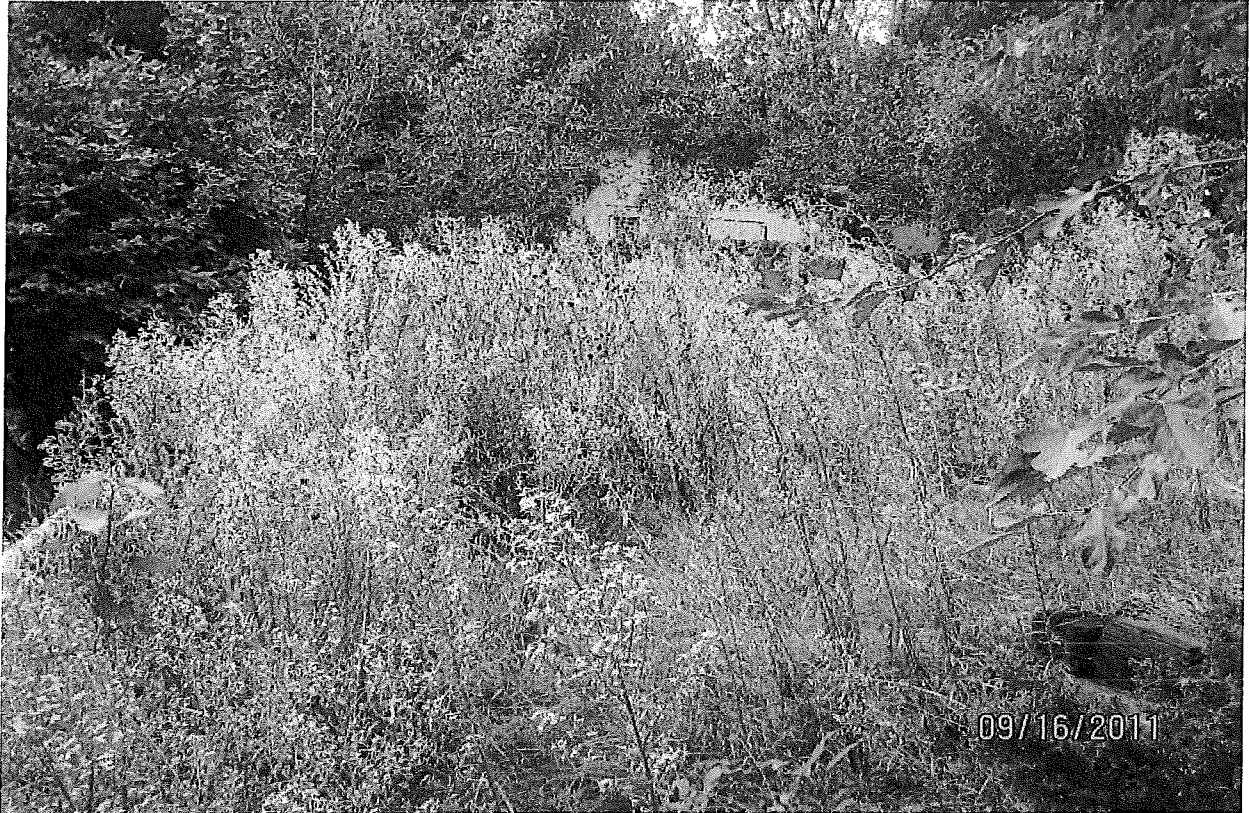
Before Pictures Taken By: S. Corbit S Corbit