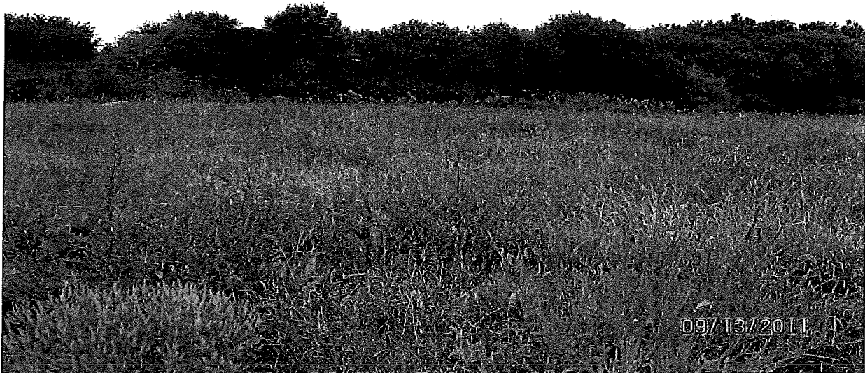
Before Pictures Taken By: S. Corbit S. Corbit