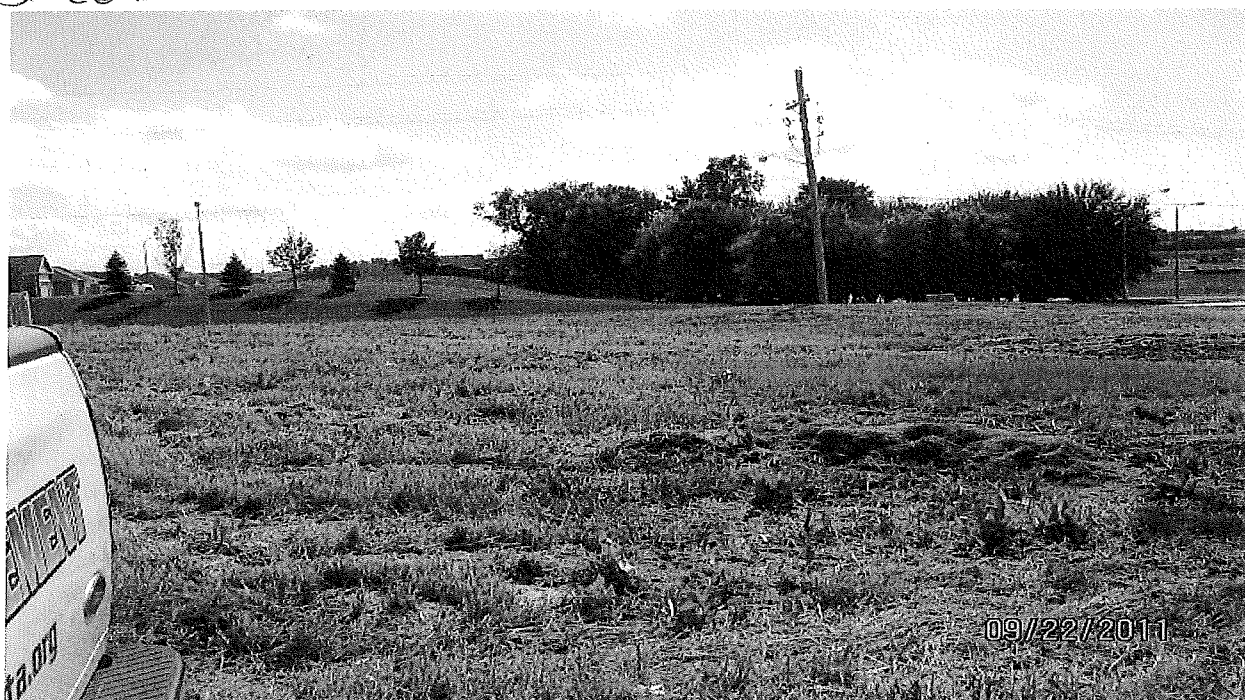
After Pictures Taken By: S. Corbit S. Corbit