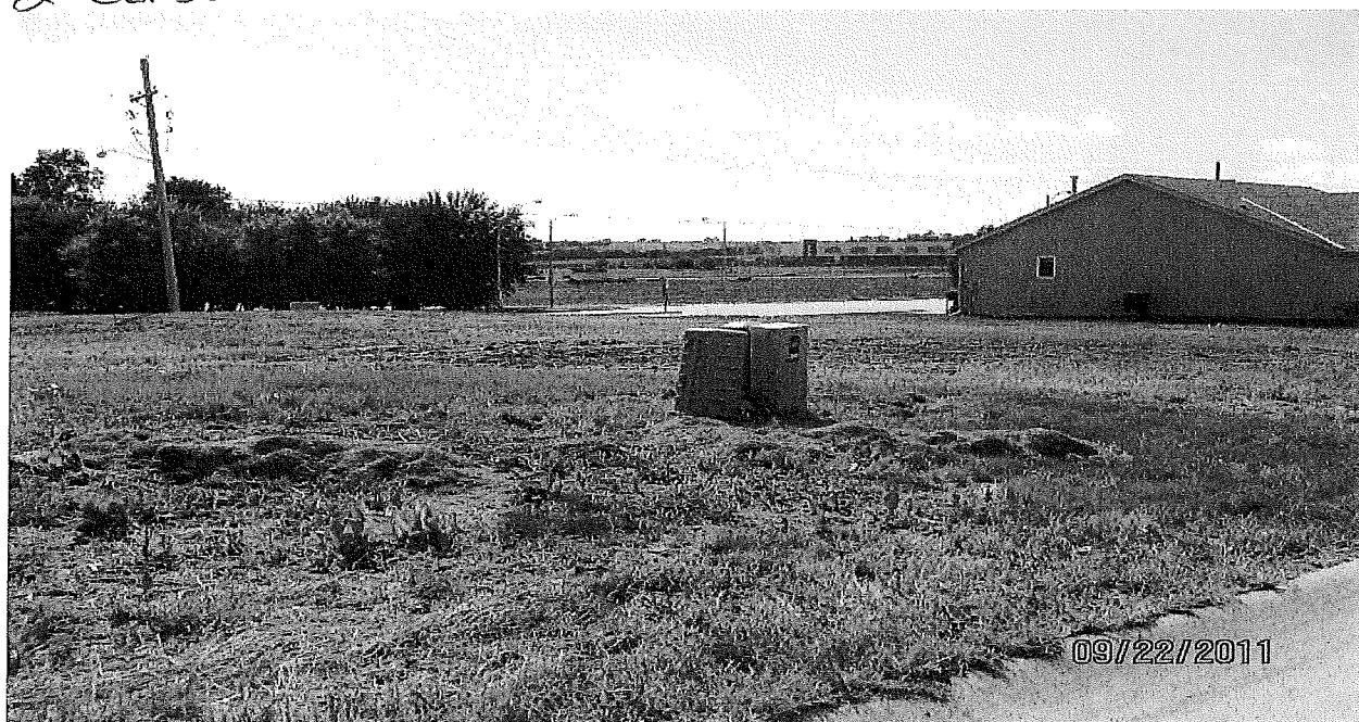
After Pictures Taken By: S. Corbit S. Corbit